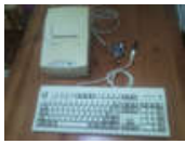
Making a typewriter with an old keyboard and a dot matrix printer (Photos) by furri