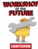
How to Enter the Craftsman Workshop of the Future Contest by Contest Robot