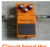
Circuit bend the DS-1 by lp_man