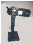
I needed a stand to hold the camcorder in the classroom by eta-beta